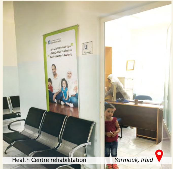
Health Centre rehabilitation