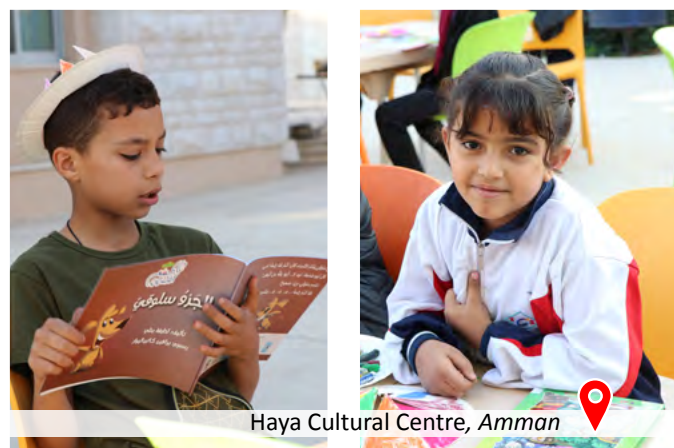
Haya Cultural Centre, Amman