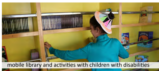
mobile library and activities with children with disabilities